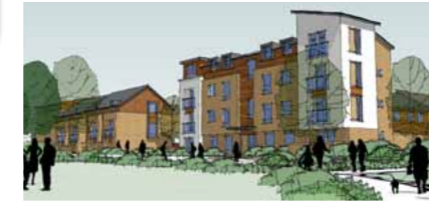
Artist's impression of Exford Avenue

Unfortunately, we were unable to appoint a preferred developer for Cumbrian Way Shopping Parade. However we are very keen to see this site developed to benefit the local community and we are planning other ways to ensure this site is regenerated. In the meantime council homes will continue to be built at the site.